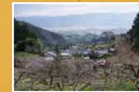
View of the Koyaguchi district from Kuju