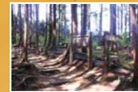
Mt. Iwawaki Third Station on the Diamond Trail