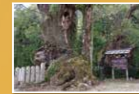
Great camphor tree at Shinoda-jinja Shrine