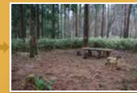
Mt. Minami-Katsuragi, tallest of the Izumi Range