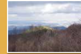
View of Osaka Bay from the observation deck atop Mt. Izumi-Katsuragi