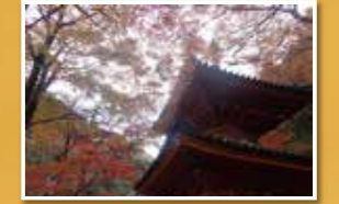
The famous fall foliage of Dai-itoku-ji Temple