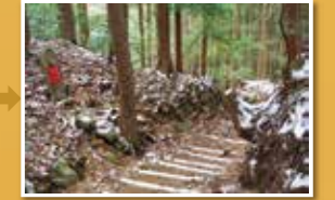
The Choishi Jizo statues of the Jizo-san Trail watch over hikers