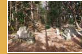
Remains of stone lanterns on Biwa-daira