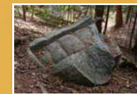
A trail linking fantastically shaped rocks, with the Kumeno-iwahashi