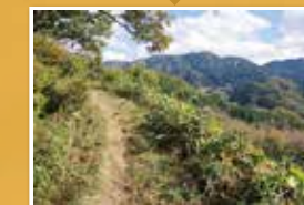
Head for Chikatsu Asuka Fudoki-No-Oka Historical Park