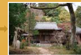
Main hall of Koki-ji Temple. The sutra mound is off limits to visitors.