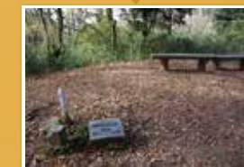
An open space at the summit of Mt. Iwahashi