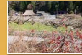
Kono district in Shigo settlement (a.k.a., Homeland of Kushigaki)