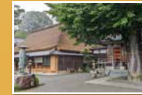
Horikoshi Shaku-kannon Temple, which venerates the Juichimen Kannon