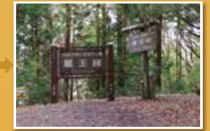
Zao-toge Pass, location of the Katsuragi Zao Gongen-sha Shrine