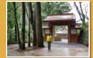
Kotakiji Temple, believed to be the location of Sutra Mound #14